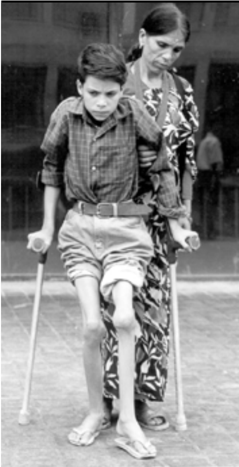
A boy with hemophilia from Nepal.

H emophilia affects about 400,000 people worldwide. Seventy-five percent receive little or no treatment. With treatment products and proper care people with hemophilia can live perfectly healthy lives. Without treatment hemophilia can cause crippling pain, severe joint damage, disability, and death.