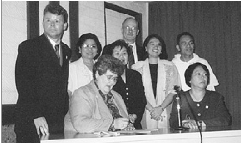
Official launch of the twinning partnership between the Hemophilia Association of the Philippines (HAPLOS) and the Victoria chapter of Haemophilia Foundation Australia.

Twinning is formal because organizations must arrange a verbal or written agreement about the twinning project or activity. Twinning is not one organization giving to another in need. It is two-way because twinned organizations work together, share information, and are both better off as a result. Twinning fosters this collaboration and partnership.