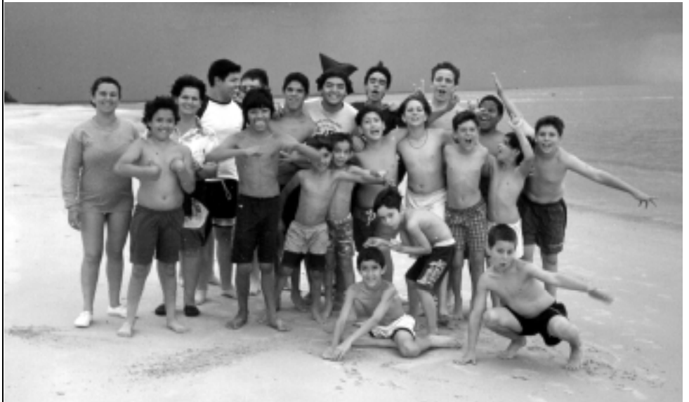
Boys from Argentina participated in a summer camp in Uruguay, organized by the Argentinean association's twin.