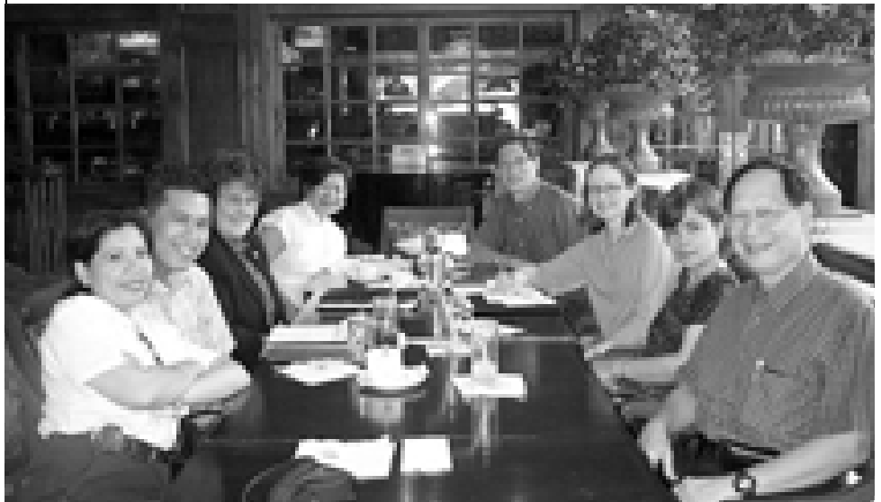
Australia – Philippines twins meet to evaluate progress and set new goals and objectives.

Partnership involves working together with your twin on a project or activity. Effective communication across cultural and language barriers is the bridge that allows twinning partnerships to be successful.