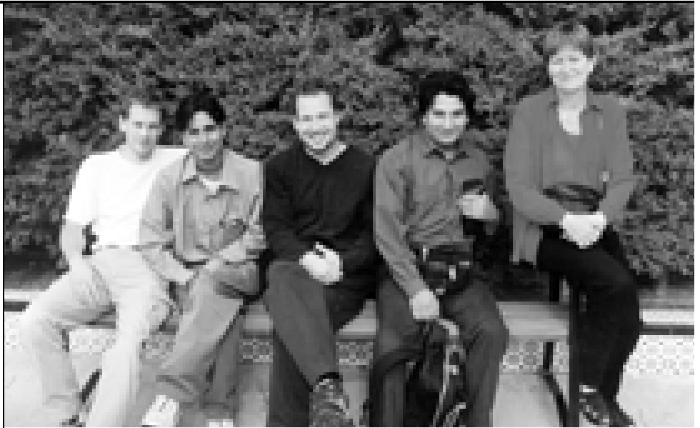
Members of the Swedish and Nepal Hemophilia Societies have found their partnership to be very rewarding.