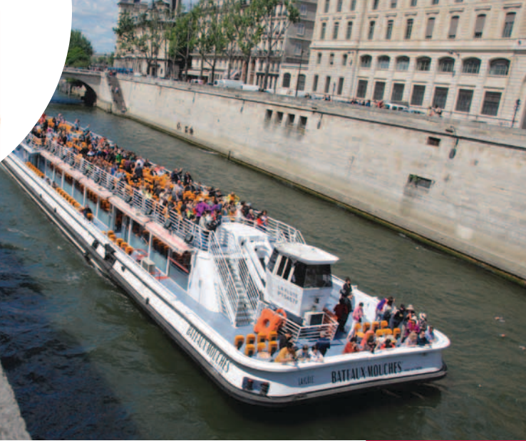
Cruise along La Seine.