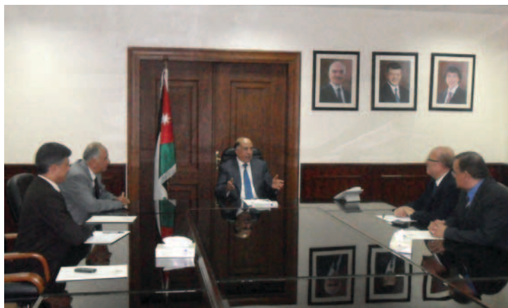
Meeting with the Jordanian Minister of Health.

A board training was held in Chisinau for 20 participants from all regions of the country. The workshop was facilitated by the WFH delegation and a Polish Hemophilia Society representative that is twinned with Moldova. The topics discussed were lobbying, media relations, good governance, and succession planning. This activity was followed-up with a visit to Warsaw by three Moldovan patient leaders to attend the Polish Hemophilia Society's elections and general assembly. ■