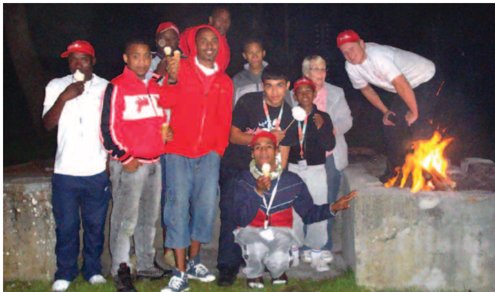
Young men with hemophilia attending camp.

The WFH is grateful for the support of the GAP program by founding sponsor Baxter; sustaining sponsors the André de la Porte Family Foundation, Bayer, and CSL Behring; supporting sponsors Biogen Idec Hemophilia, Biotest, Grifols, and Pfizer; contributing sponsor the Irish Haemophilia Society; and collaborating partner the World Health Organization (WHO).