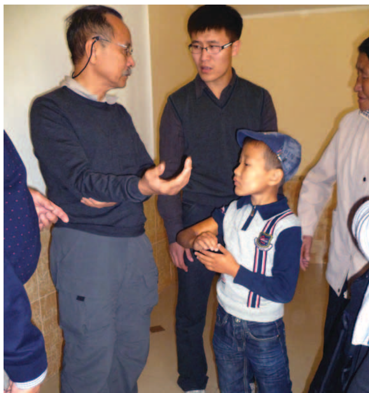
Attendees of the clinical workshop in Ulaanbaatar, Mongolia.

A clinical workshop covering a wide range of comprehensive care topics was held for two days in Ulaanbaatar, in September. It was followed by a one-day workshop with the Mongolian Association of